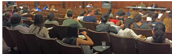
Picture from Icahn School of Medicine Debate: The Role of Profits in Healthcare

Students submit a Post-Event Report to us at the conclusion of their events, and these details are captured in a "POST-EVENT SUMMARY" on every event, whether a big debate or lunchtime lecture. You can see how many people attended, what was discussed, what students had to say about the event, pictures, and much more.